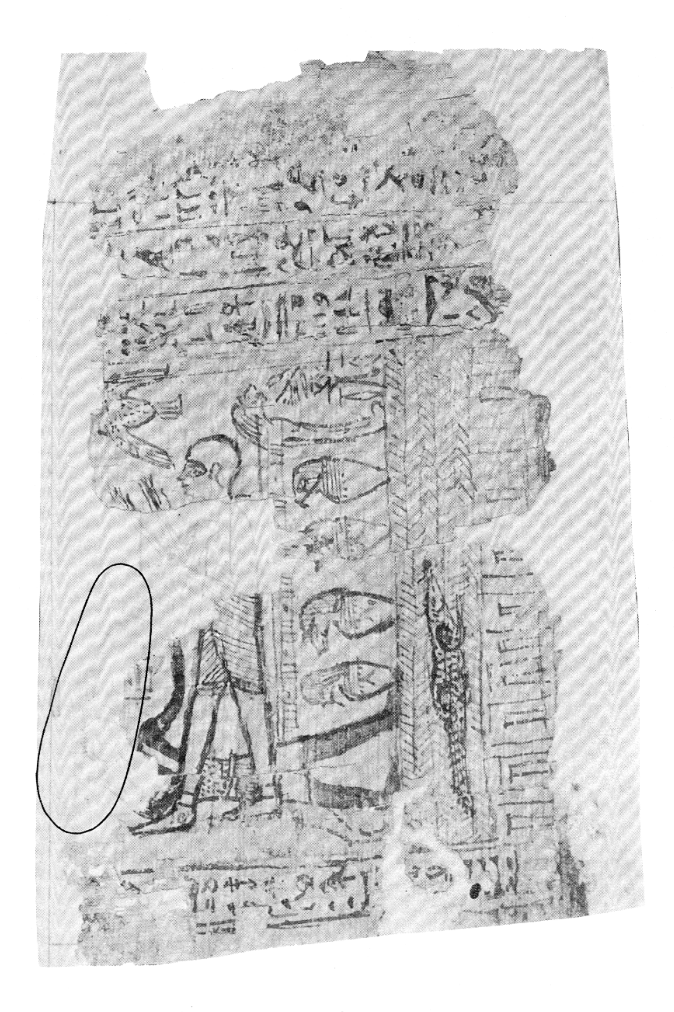
Facsimile No. 1 from the papyrus fragments given the Church by the New York Metropolitan Museum of Art. The glue line (circled) does not show up on the photography as plainly as on the original.