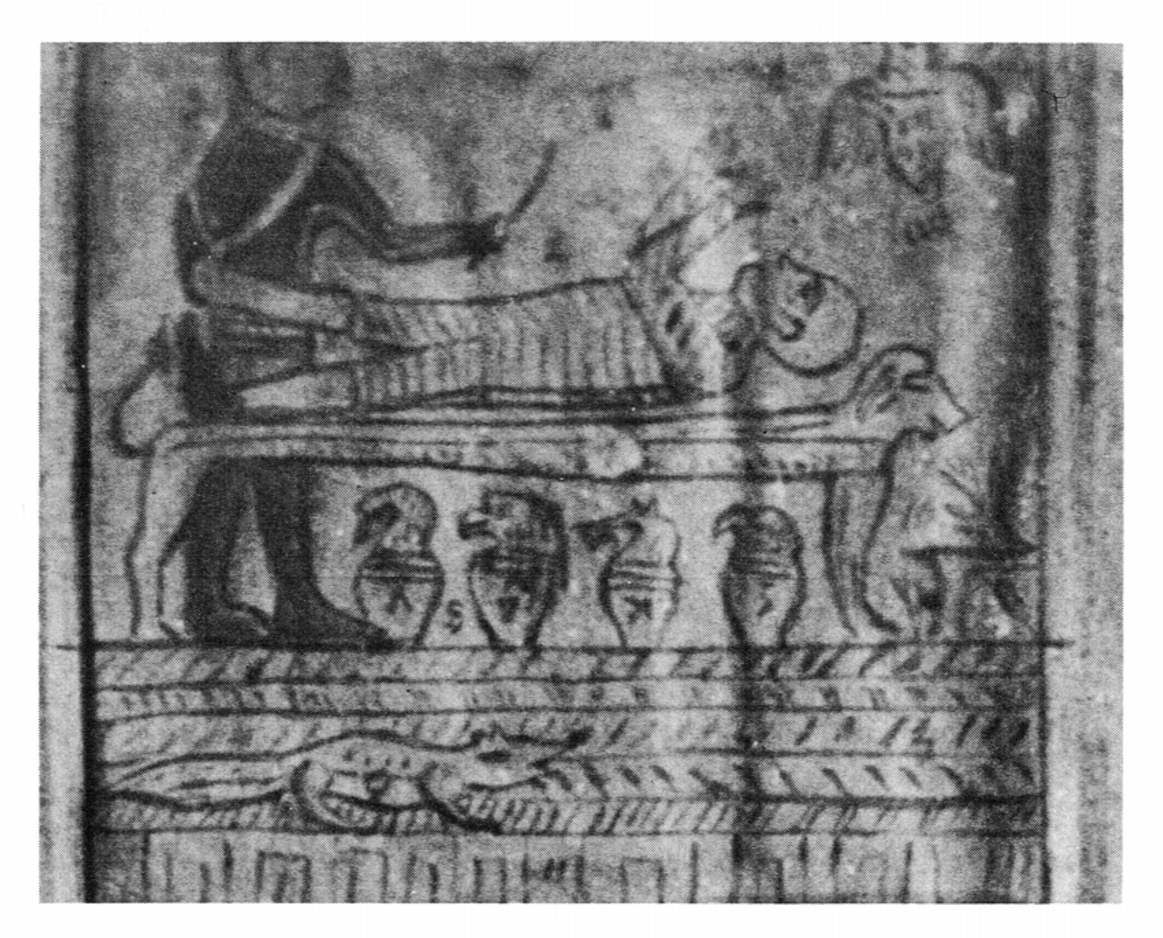
An enlarged reproduction of the replica of Facsimile No. 1 in the background of the painting of Lucy Mack Smith, taken from the photograph of that painting in the Church Historian's Office.

something that is not in the Hedlock drawing. The artist has drawn a jagged line right across the top of the facsimile, cutting off the top both of the priest's head and of the bird's head but leaving the rest, including the knife in the priest's hand, untouched. The area above the jagged line is of a slightly