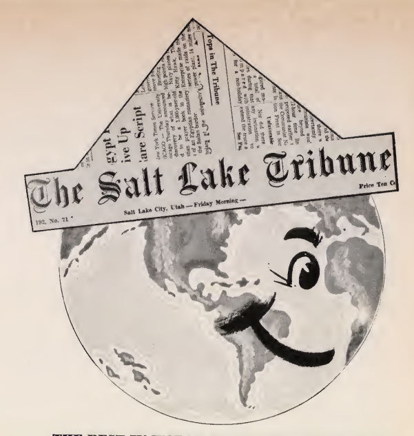
THE BEST IN WORLD WIDE NEWS COVERAGE