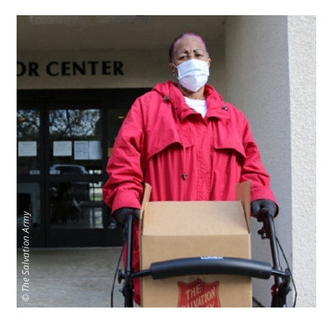
Left: Because of help from partners like Latter-day Saint Charities, The Salvation Army reports it has been able to serve more than 225 million meals in response to the COVID-19 pandemic with innovative programs such as contactless, drive-through, and delivery food pantries.

In mid-August, heavy rainfall caused massive damage to an area in northern Chungcheongbuk, South Korea. The rain devastated houses and roads in the community. In response, Latter-day Saint Charities mobilized local Helping Hands volunteers to clear and clean up damages.