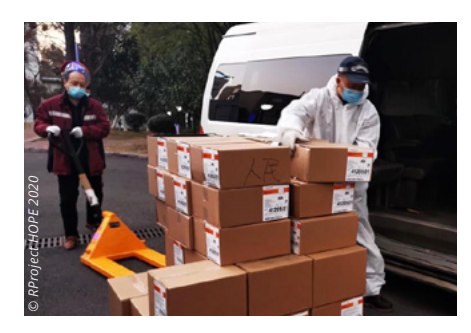
Above: Latter-day Saint Charities works with Project HOPE to send emergency items to China at the beginning of the COVID-19 pandemic.

AT LATTER-DAY SAINT CHARITIES , we increased our humanitarian efforts during 2020. With the impact of the COVID-19 global pandemic, we adjusted our focus to meet emerging needs. Thanks to the support of partners and donors, our 2020 COVID-19 response effort included 1,031 projects in 151 countries and territories. Some of these projects entailed