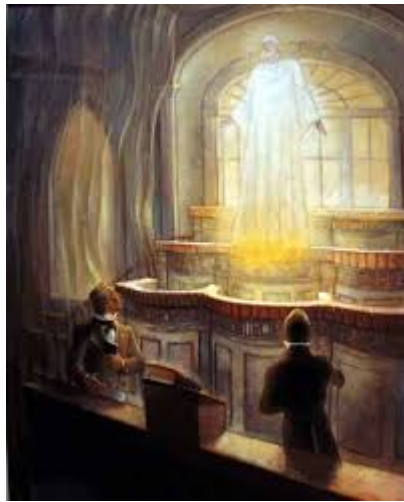
Elijah appears to Joseph and Oliver.