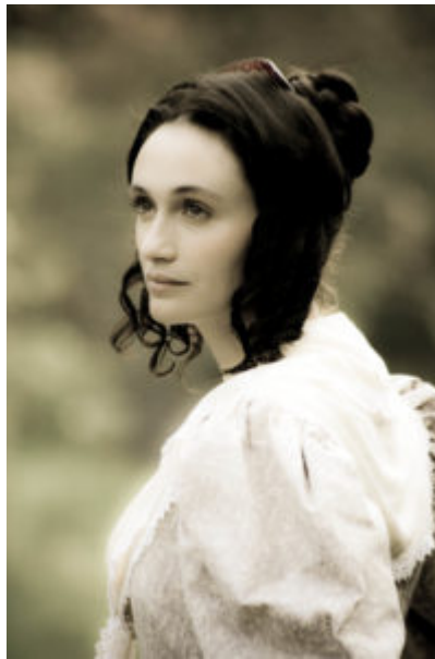
Depiction of Emma Smith

McLellin reported that in his attempts to find resolution, Joseph “confessed humbly, and begged forgiveness,” and added, “Emma and all forgave him.”