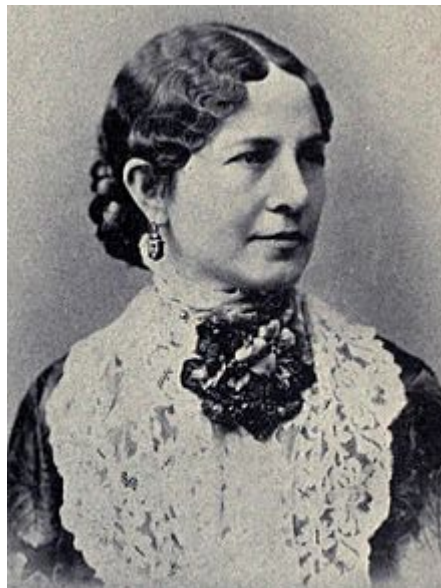
Ann Eliza Webb Young

This would have been distressing to any wife, and Emma was no exception.