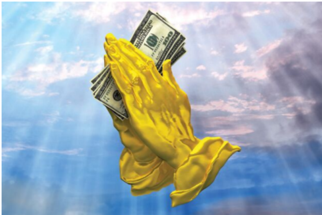
Illustration by Labour