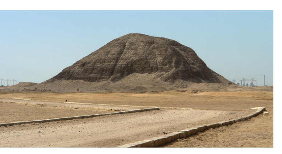
Amenemhet III built this pyramid at Hawara in the Fayyum; it may have been his final resting place.

away from the Nile and relying on canals and irrigation posed a big risk, which might explain Pharaoh Amenemhet III's careful attention to measuring the water levels of the Nile. In addition to building canals and retention walls, Amenemhet III had a Nilometer installed at the Second Cataract in order to record the peak water height each year. This enabled the pharaoh to estimate the coming season's harvest and understand the needs of the area.