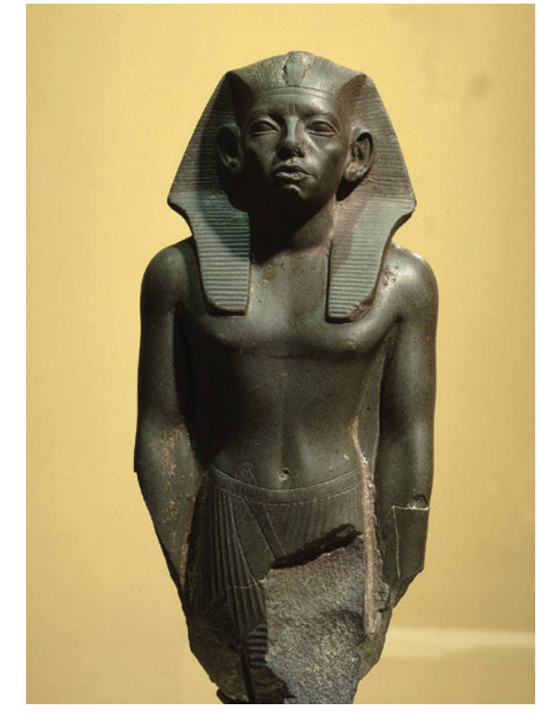
An outstanding example of Egyptian portraiture, this is a realistic depiction of the care-worn face of Amenemhet III, a pharaoh of the Twelfth Dynasty.

canal in what seems like an aquatic obstacle course as they establish themselves in the afterlife.<sup>27</sup> This is of interest because suddenly Sobek becomes the lord not only of the waterway of the Nile but also of the winding waterway of the heavens.