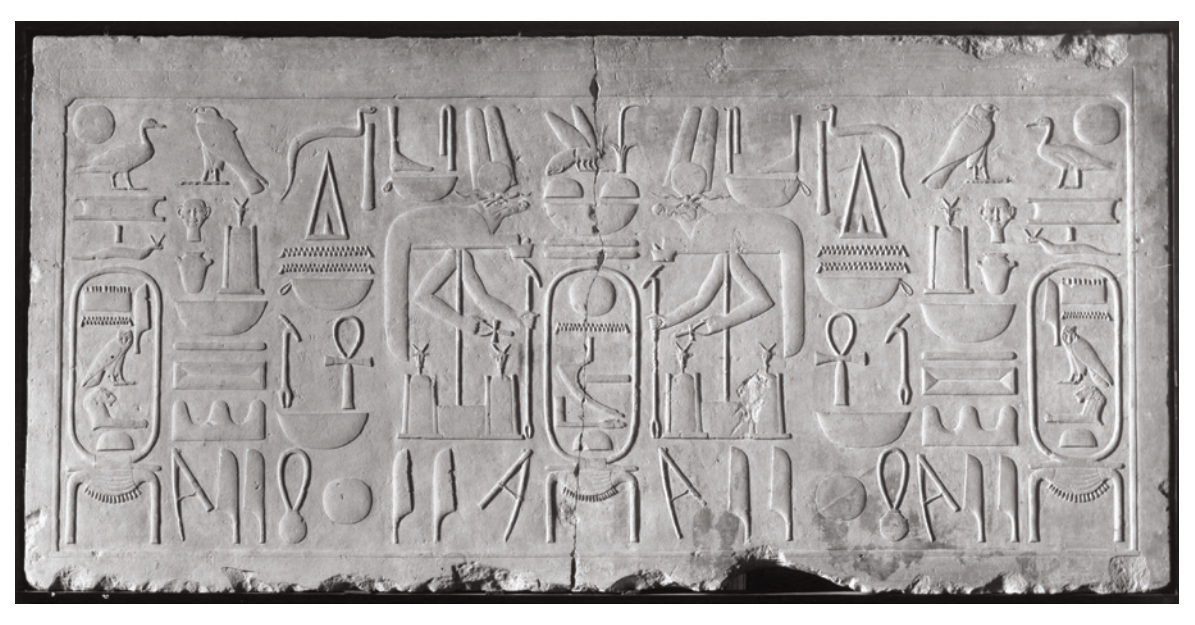
Amenemhet's name appears in the cartouches on either side of the lintel. His other royal name, Nimaatre, is centered between the unusual depictions of the god Sobek.

There are two more spells, however, that add even more compelling reasons for Amenemhet III's interest in Sobek. Both spells 268 and 285 of the Coffin Texts speak of "becoming Sobek, Lord of the winding waterway."26 Although "winding waterway" accurately describes the Nile, that is not the only possible interpretation. In ancient Egyptian religion, when people die, their souls cross a winding