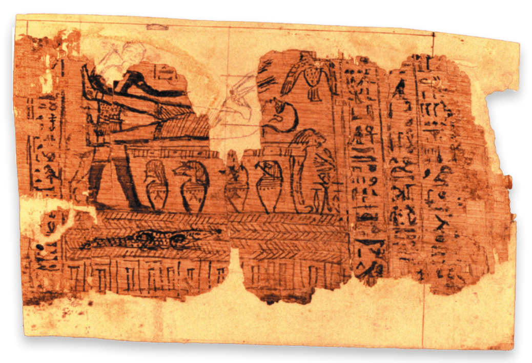
Facsimile 1 in the Book of Abraham is the reproduction of this original fragment of Joseph Smith Papyrus I. Note the crocodile in the lower left portion of the fragment.

any Latter-day Saint scholars have connected the crocodile god Sobek of Egypt's Middle Kingdom period with the "idolatrous god of Pharaoh" depicted as a crocodile in Facsimile 1, figure 9, of the Book of Abraham. Exploring this identification further, I look at textual and archaeological evidence that helps illuminate who Sobek was and how he was worshipped. I also document that the Middle Kingdom period (in which Abraham is thought to have lived)<sup>2</sup> saw the Sobek cult rise in popularity, specifically during the reign of Pharaoh Amenemhet III. This background study puts us in a better position to consider whether the reptilian god Sobek can be plausibly identified as the idolatrous god of figure 9 in Facsimile 1.