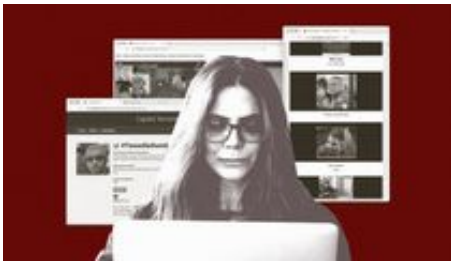
'Sedition Hunters': Meet The Online Sleuths Aiding The FBI's Capitol Manhunt