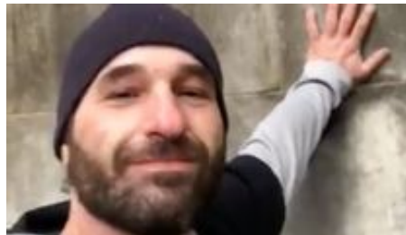
Capitol Rioter Who Thought He Was At The White House Released On Home Detention