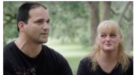
Famous QAnon Couple Featured In Documentaries Arrested In Capitol Attack

Do you have information you want to share with HuffPost? Here's how.