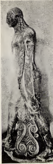
THIS LARGE STATUE OF APOLLO IS ONE OF THE MOST FAMOUS OF THE ETRUSCAN ART TREASURES YET DISCOVERED.

rocks. At the entrance of the tombs are tombstones or markers cut out of rock, small houses or oblongs about a foot in size representing a lady, while the marker of a man was a mushroom topsy turvy some eighteen inches tall. In front of some mounds many markers are found placed in a tray of stone. Babies and small children were buried in