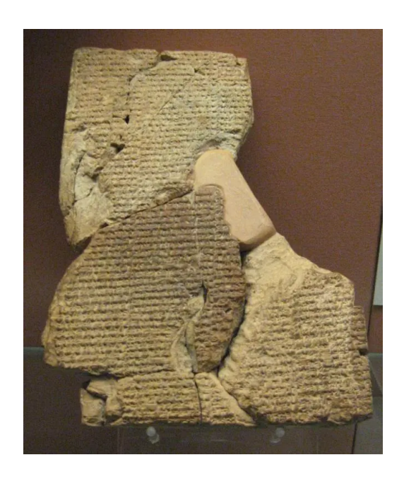
Atrahasis, an ancient mesopotamian creation and flood story.

What was the point then? Summarized, Israelites knew flood stories from