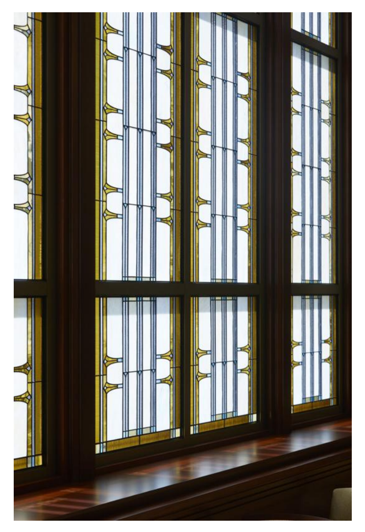
Some of the stained glass windows in the new Meridian temple include images of Syringa flower, Idaho's state flower.