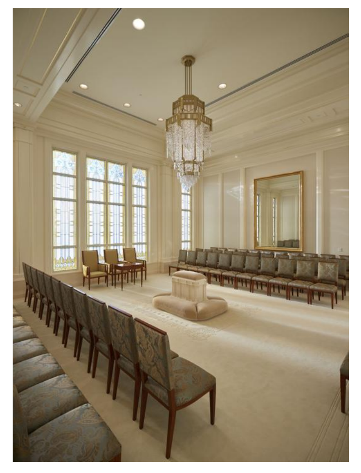
One of five sealing rooms at the Meridian temple, where marriage ceremonies are performed.

The basement of the temple has a baptismal font — a small marble pool filled with water - where church members can be baptized on behalf of someone who has died. The font sits on sculptures of 12 oxen, representing the 12 tribes of Israel from the Bible.