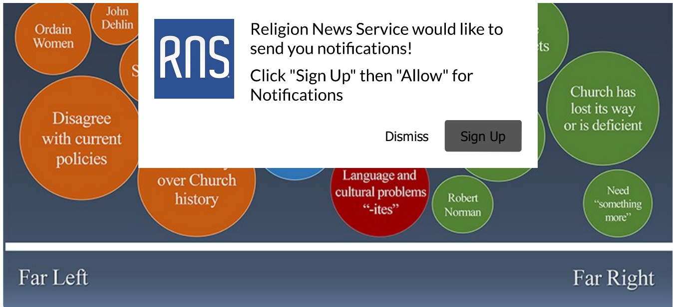
“Issues and Ideas Leading People Away from the Gospel.”

(RNS) There’s WikiLeaks and VatiLeaks. And now there’s MormonLeaks.