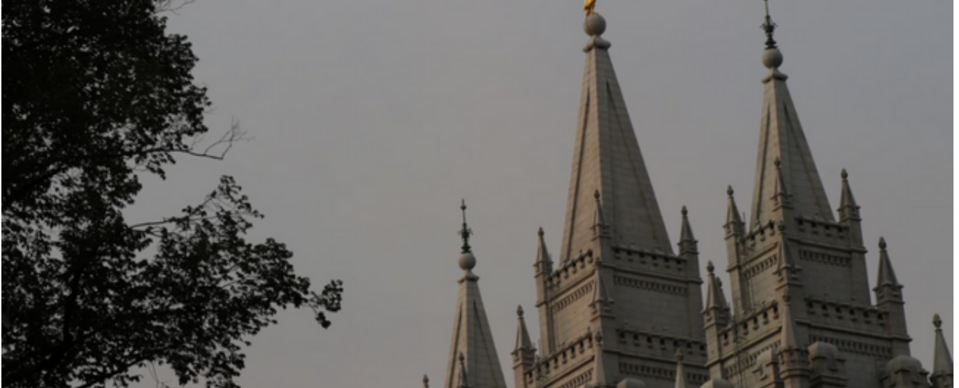
The Church of Jesus Christ of Latter-day Saints is at the center of a lawsuit that claims the institution could have prevented two young girls from being sexually abused.

The lawsuit names The Church of Jesus Christ of Latter-day Saints, which oversees Branham Ward operations, stating it had a duty to protect the young girls from sexual abuse by Church leaders. It also stated Neipp inappropriately "groomed" the girls on Church property.