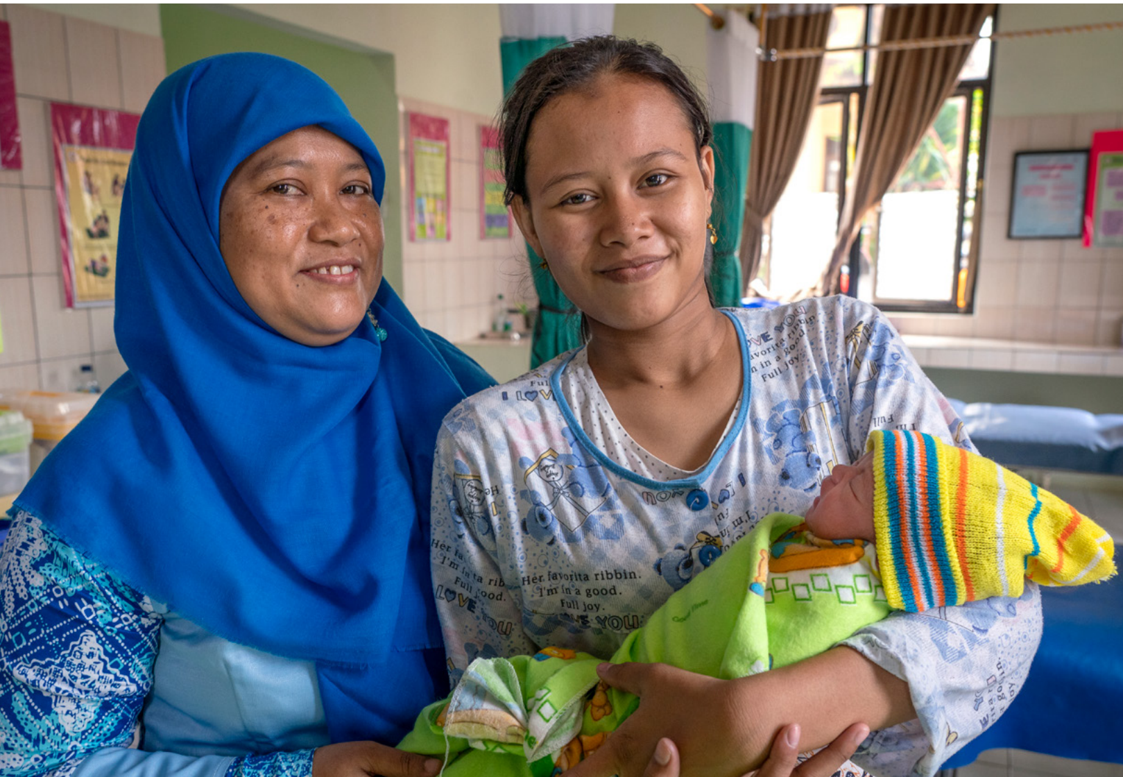
Above: A nurse in Banyumas, Indonesia, stands next to a new mother. In 2018, nurses in this birthing center completed a Helping Babies Breathe course run by LDS Charities facilitators.