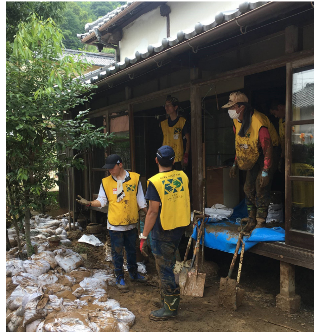
Top left and right: Helping Hands volunteers work to clear debris following flooding in southwestern Japan. Bottom left: Volunteers help move emergency food supplies to evacuation and volunteer centers.