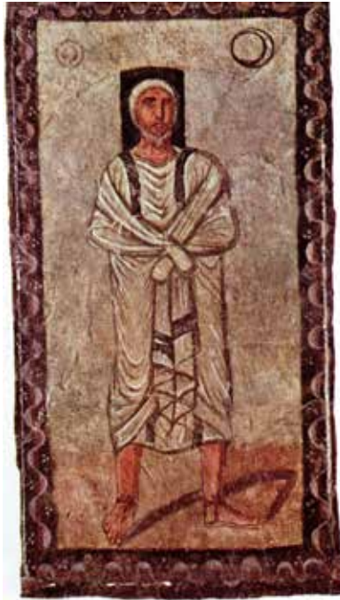
Figure 12. Moses with the sun, moon, and seven stars (i.e., planets) above his head from the Jewish synagogue at Dura Europos. 239 It represents Moses’s recitation of a “hymn” near the end of his ascent. 240

ascent .” 236 Near the end of Abraham’s recitation, he implores God to accept the words of his prayer and the sacrifice that he has offered, to teach him and to “make known to your servant as you have promised me.” 237 Then, “while [he] was still reciting the [hymn],” the veil opens and the throne of glory appears to his view. 238