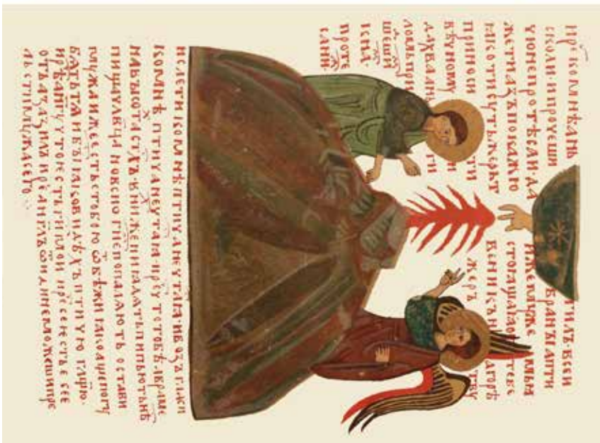
Figure 5. Abraham's Sacrifice Is Accepted of the Lord.