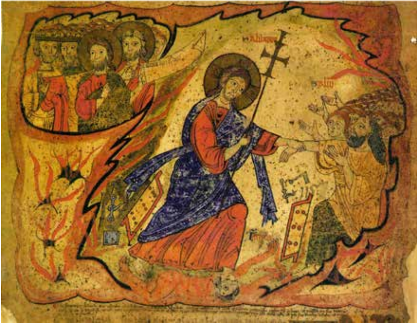
Figure 8. The Harrowing of Hell. The Barberini Exultet Roll, ca. 1087. 153 Note that Jesus is depicted as having two right hands, consistent with related accounts of God in Jewish Midrash. 154

Medieval Christian depictions such as this one shown in Figure 8 that show of the resurrected Christ raising up the dead by the same gesture 152 further guide our intuitions about the importance of the raising of Moses and Abraham and how it may have been meant to be understood by the illustrator of the Codex Sylvester.