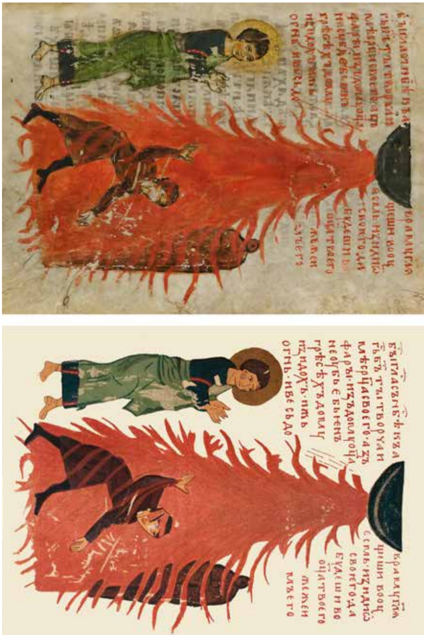
Figure 4. The House of Terah Destroyed by Fire.