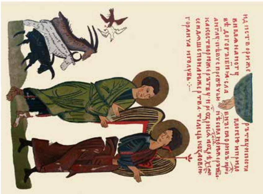
Figure 3. Abraham with Sacrificial Animals. Left: Photo of the Codex Sylvester. Right: Photo of the facsimile version.