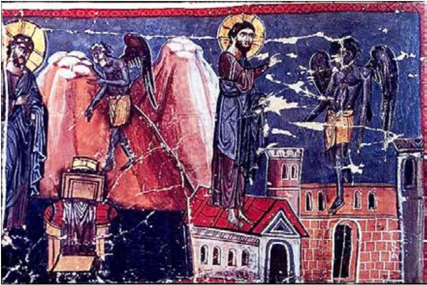
Figure 9. The Temptation of Christ, King Gagit I of Kars Gospels, ca. 1050. 164