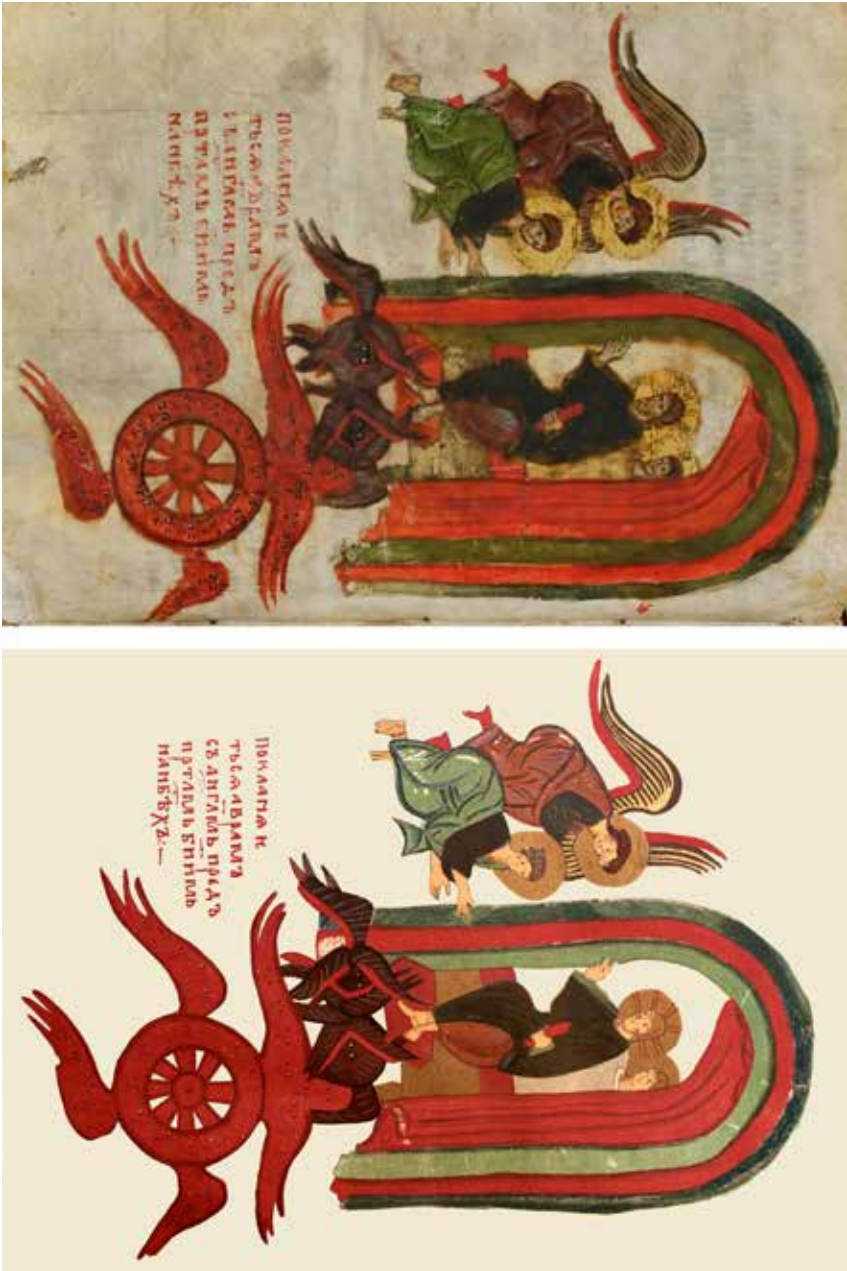
Figure 13. Abraham and Yaho'el Before the Divine Throne.