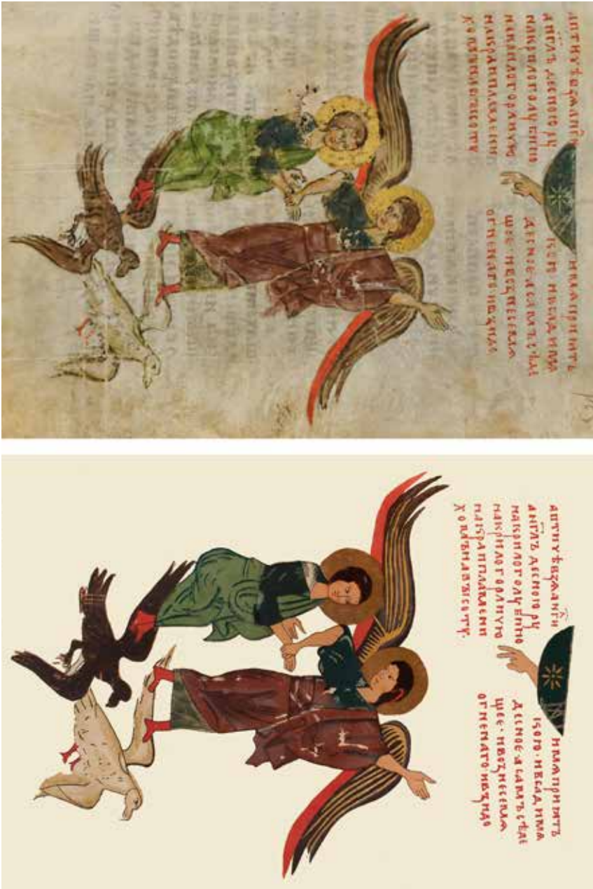
Figure 10. Ascent of Abraham and Yaho'el.