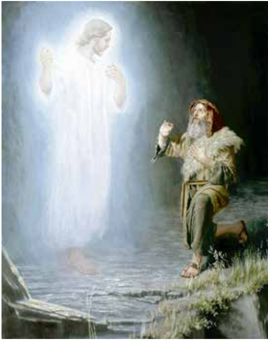
Figure 1. Joseph Brickey: Moses Seeing Jehovah . 43