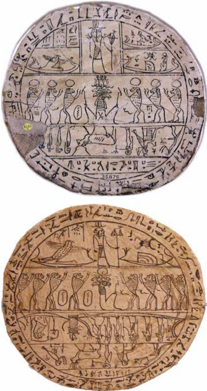
Figure 6. Two Egyptian hypocephali, representing circular depictions of the cosmos. Top: British Museum 35875 (formerly 8445c); bottom: Louvre Museum E 6208. 138