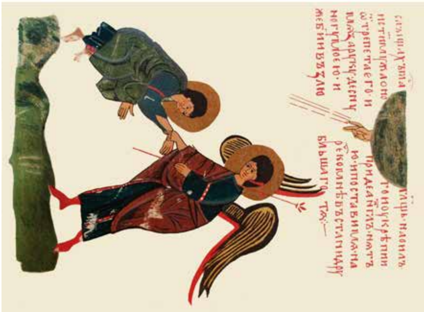
Figure 7. Abraham Falls to the Earth and Is Raised by Yaho'el.