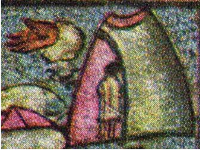
Figure 11. Detail from the Torah shrine of the Dura Europos synagogue. 213

Abraham, provides instructions to him about what to say at the veil, and promises to remain with him, “strengthening” him, as he comes into the presence of the Lord. 212