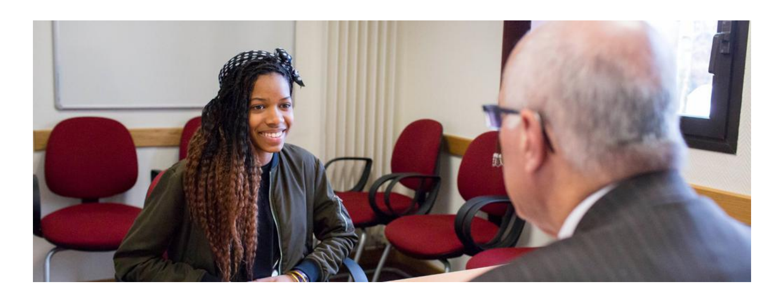
6 October 2019 - Salt Lake City | October 2019 General Conference

While standards to enter a temple stay the same, these modifications better prepare Latter-day Saints for worship in temples