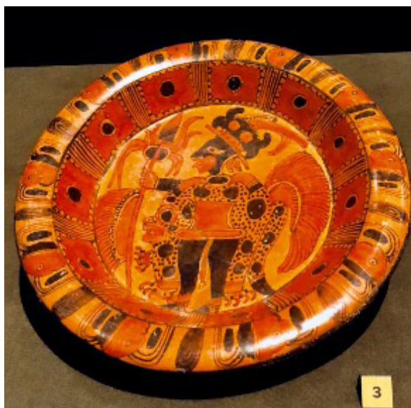
Figure 3. Maya ceramic plate (circa 593–731 CE). Courtesy of the Denver Museum of Nature & Science, AC.8652.

Blackening is depicted on numerous cylindrical vases in Justin Kerr's impressive collection of photographs of Maya artifacts. 100 Mayanists associate the scene in Figure 4 with the ruler Sak Muwaan who reigned