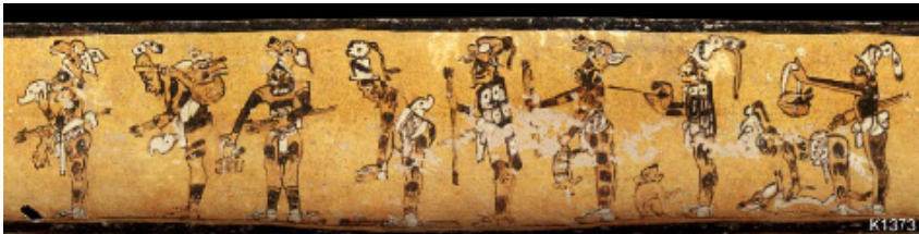
Figure 6. Maya hunting scene courtesy of Justin Kerr, K1373, Dumbarton Oaks, Trustees for Harvard University, Washington, DC.

Hunting involved more variety, as shown in the following roll-out view of a deer hunting scene on a Maya vase. The hunters' designs, however, all had one obvious purpose. Each of them used black paint as a "form of camouflage for ... stealth" so that "the human body could thereby not be easily distinguished from the mottled light and color under the jungle canopy." 105 Black handprints, a primitive art form, were "set upon" hunters as well as warriors to conceal them in the shadows and forest greenery. It seems logical that Lamanites, as well as Nephites (see Enos 1:3, 20), would have relied on similar disguise when hunting, as do hunters today. By the way, it was no coincidence that the markings evident in figures 6 and 7 mimicked the jaguar, the largest of the world's spotted cats and the most feared predator in Mesoamerica. 106