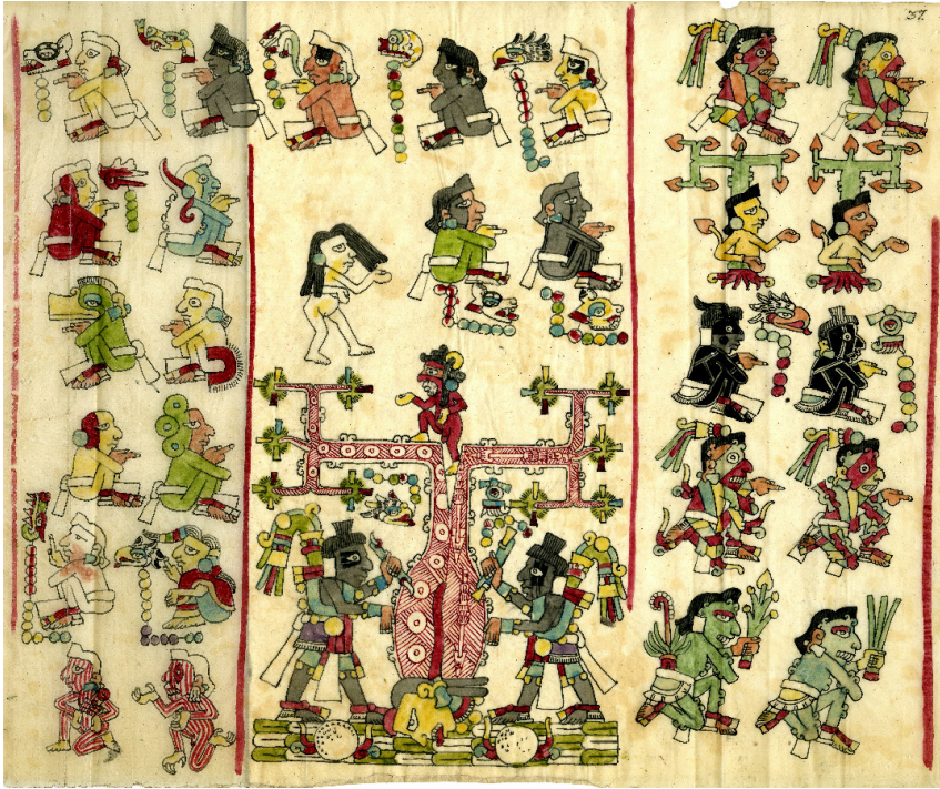
Figure 8. The Tree of Apoala, Vindobonensis Codex (post 900 CE).

that mimics the Maya. They are surrounded by men engaged in various activities, painted in diverse colors and patterns.