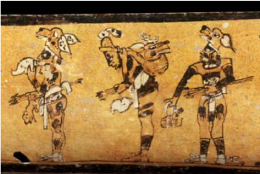
Figure 7. Detail of camouflaged Maya hunters, courtesy of Justin Kerr, K1373, Dumbarton Oaks, Trustees for Harvard University, Washington, DC.

Bishop de Landa observed that black and red were the primary colors of the ancient Maya body paint palette. This corroborates the Book of Mormon's lexicon of colors associated with conflict. 109 Indeed, these are the only colors that Nephite prophets mentioned, except for white and one reference to gray hair. They employed color with "great restraint." 110 Among the Maya, the first "quantum leap" in color complexity did not come until after about 300 BCE. 111