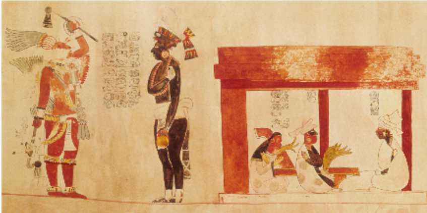
Figure 1. Detail of Uaxactun mural (circa 300 BCE–900 CE). Museum Collections, 1950. Courtesy of the Peabody Museum of Archaeology and Ethnology, Harvard University, 50–1–20/22982.

Fascinating details about this tradition are revealed in a mural at Uaxactun in northern Guatemala (inhabited between 300 BCE and 900 CE). 94 According to Mayanists Coe and Houston, Figure 1 depicts a Maya personage who is painted in black (except for his hands and feet) and is greeting a visitor who is costumed as a Teotihuacan warrior. Both are wearing loincloths. According to these scholars, the three “noble ladies” seated nearby are displaying their body paint. 95 They suggest that face painting on females may have been seen as “alluring.” 96 Initially Nephi perceived that the skin of blackness, which may have been soot and charcoal at that time, would prevent his people from being enticed by Lamanites, who were “exceedingly fair and delightsome” (2 Nephi 5:21). 97 However, the flattering cosmetic decor upon the women in this mural illustrates how later, an artistic application of stains may have enhanced their natural beauty. Figure 2 shows additional detail from the same mural. It depicts two men wearing elaborate ceremonial garments about their loins. The upper torso of one is blackened.