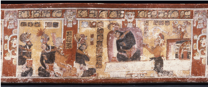
Figure 5. Enthroned Maya Lord and attendants

Hunting involved more variety, as shown in the following roll-out view of a deer hunting scene on a Maya vase. The hunters' designs, however, all had one obvious purpose. Each of them used black paint as a "form of camouflage for ... stealth" so that "the human body could thereby not be easily distinguished from the mottled light and color under the jungle canopy." 105 Black handprints, a primitive art form, were "set upon" hunters as well as warriors to conceal them in the shadows and forest greenery. It seems logical that Lamanites, as well as Nephites (see Enos 1:3, 20), would have relied on similar disguise when hunting, as do hunters today. By the way, it was no coincidence that the markings evident in figures 6 and 7 mimicked the jaguar, the largest of the world's spotted cats and the most feared predator in Mesoamerica. 106