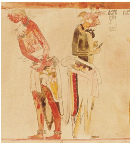
Figure 2. Detail of men in Uaxactun mural. Peabody Museum of Archaeology and Ethnology, Harvard University.