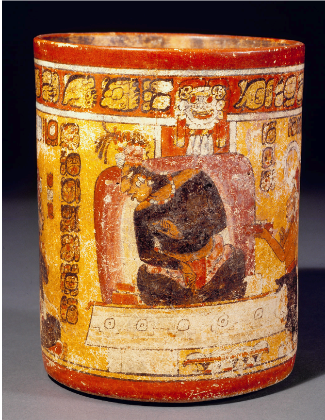
Figure 4. Maya ceramic cylinder vase (circa 650–750 CE)

sometime between 700 and 726 CE as the divine lord in the lowlands of Guatemala. 101 The vase shows a ruler whose skin is darkened except for his face, shoulders, and hands. It is believed to have been a drinking vessel of the son of Sak Muwaan (whose name, paradoxically, translates as “White Bird”), ruler of Motul de San Jose. 102 Justin Kerr’s roll-out view in Figure 5 shows four figures whose body paint is similar: the ruler and his three court attendants on the left. The person on the right, who appears to be making an offering, is not blackened.