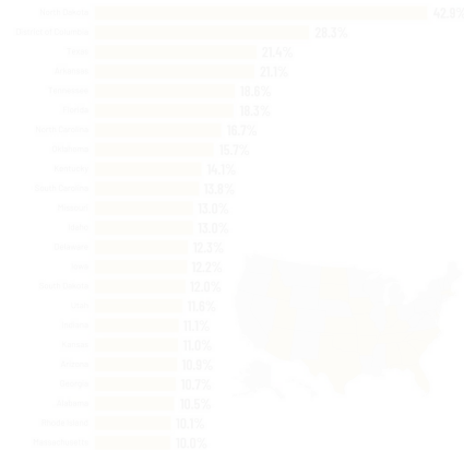
In 22 U.S. states, the number of members of The Church of Jesus Christ of Latter-day Saints grew by 10% or more during 10-year period from 2011 to 2021.

California was the only state to have fewer members in 2021 than in 2011.