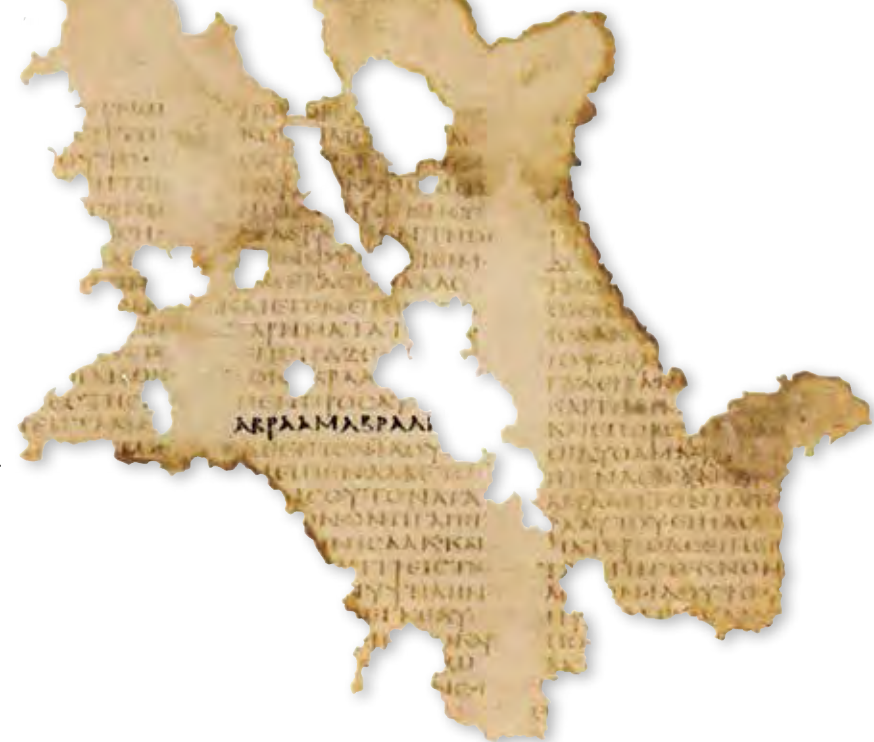
"Abraham, Abraham" (enhanced graphically) appears in Genesis 22:11 on this fragment of the Codex Sinaiticus.

While this paper provides only the briefest of surveys regarding how knowledge of biblical texts and characters could have spread to practitioners of Egyptian religion, it has made clear that there were abundant avenues and that the zeitgeist of intercultural exchange was such that we would be surprised