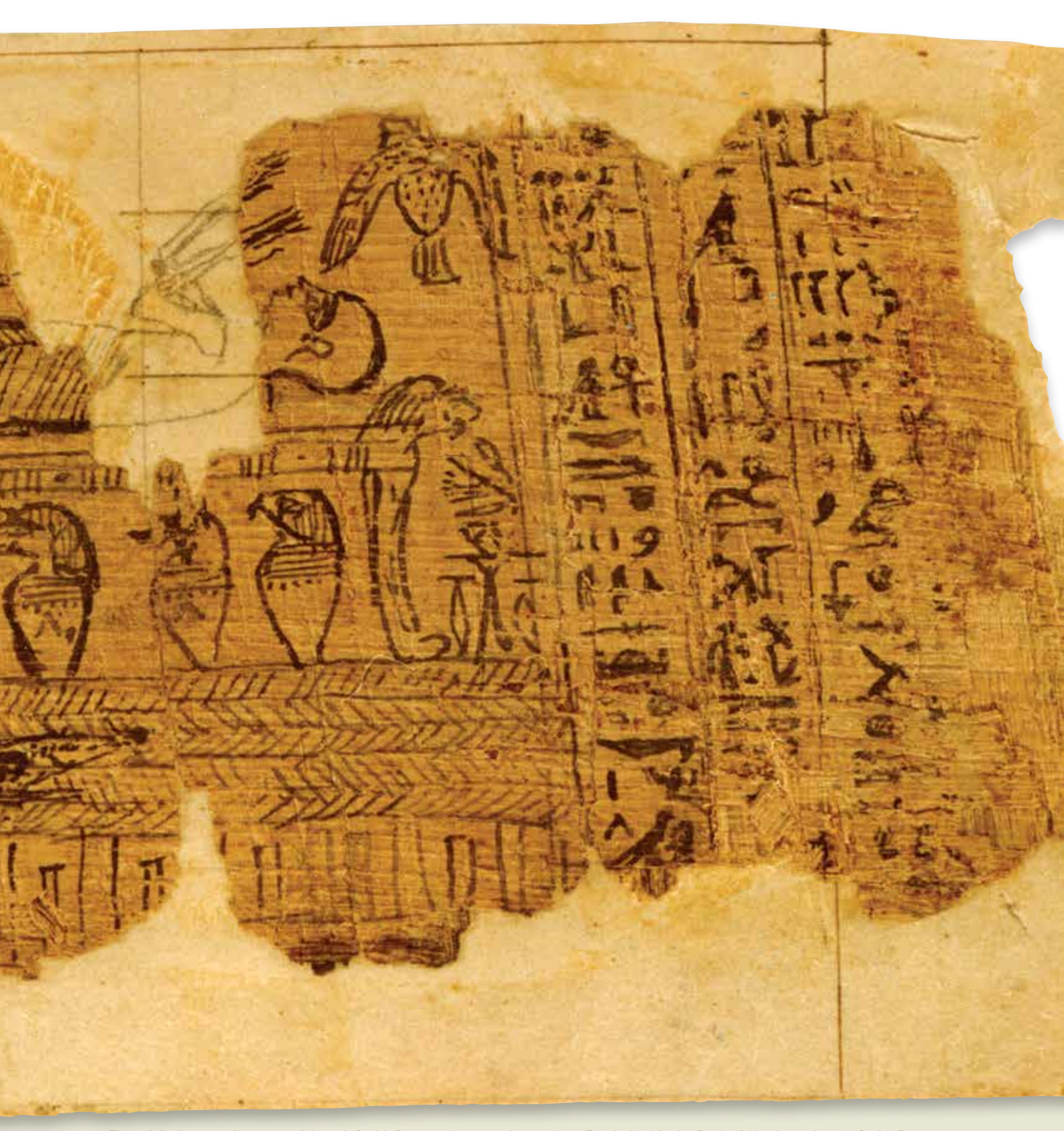
The original, extant fragment of Joseph Smith Papyrus I was used to produce Facsimile 1 in the Book of Abraham. Joseph Smith Papyrus