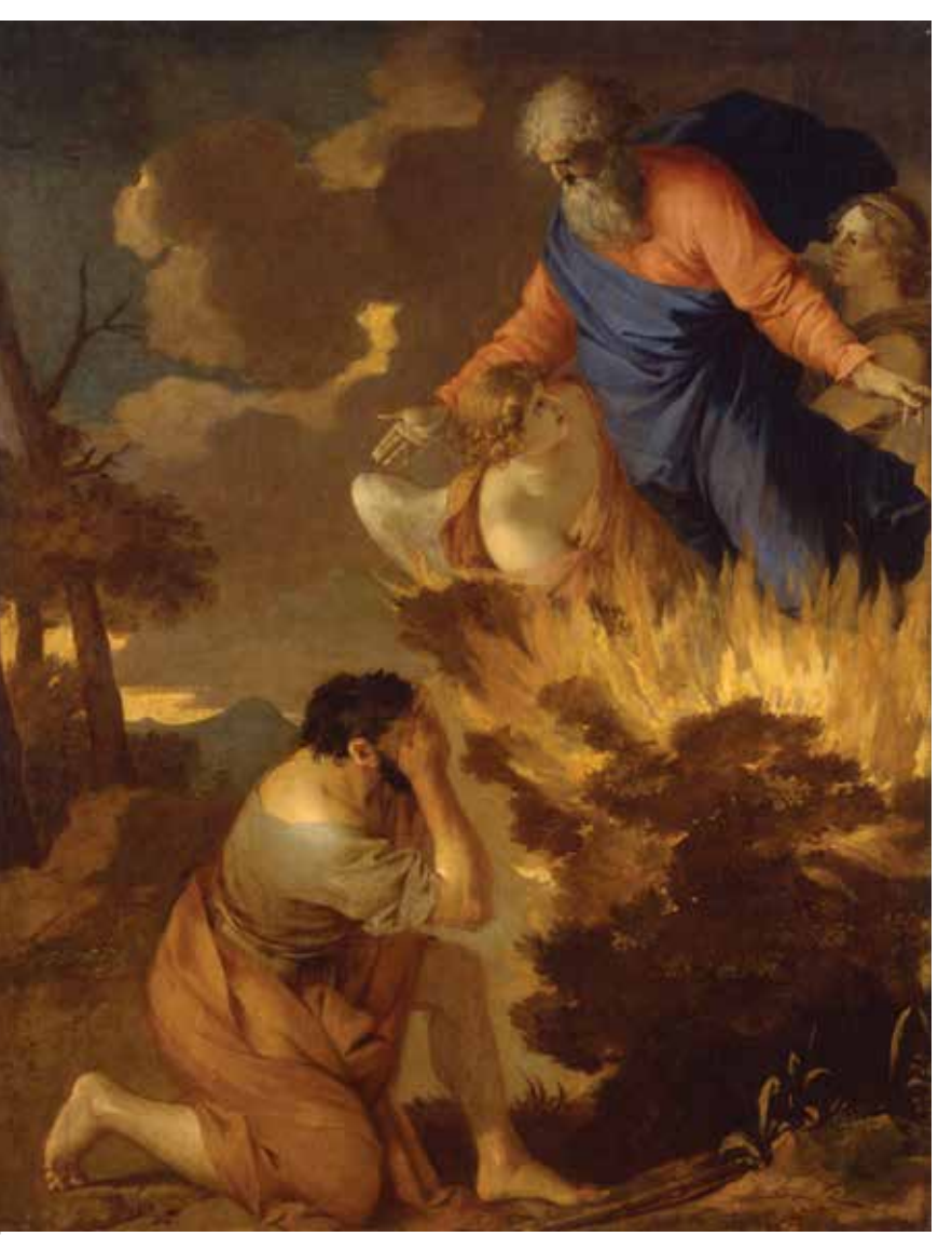
Moses and the Burning Bush, by Sebastien Bourdon. The State Hermitage Museum, St. Petersburg.

but a closer examination reveals that the frequency of associating these spells with Michael matches the overall frequency of these spells within the corpus. In other words, we do not see a pattern of connecting concepts with Michael that is any different than the pattern of associating things with biblical figures in general.