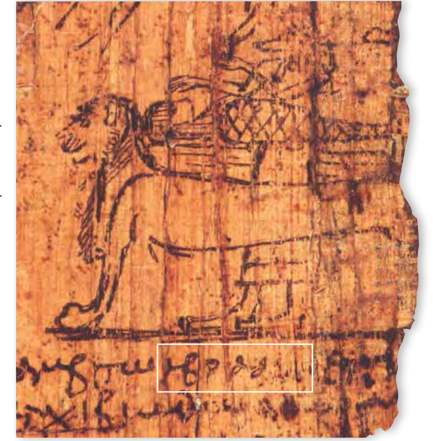
Lion couch vignette with the name Abraham highlighted directly below it. P. Leiden I 364, last column (AD 3rd-4th century).

Similarly, in a drawing that accompanies a text for a love charm, <sup>64</sup> the text specifically notes that the drawing is associated with the spell. The vignette depicts a mummiform figure on a lion couch. Here we would typically expect to identify the figure with Osiris, but the text notes that it is Abraham on the couch. <sup>65</sup> All these instances occur within an Egyptian religious context, making it clear that for whatever reason, the Egyptians viewed Abraham as