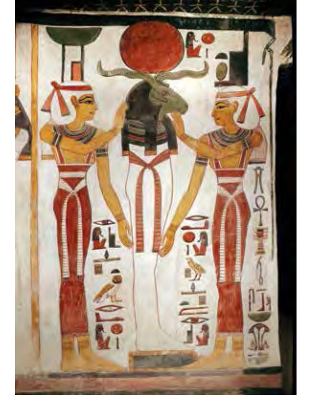
Within the tomb of Nefertari, Nephthys and Isis support the composite figure of Osiris and Ra. In this unusual depiction, the inscriptions say they are "at peace" with each other.

of important deities.<sup>68</sup> Similarly, the subsequent increased attention to Amun allowed for the expansion of religious focus. Far from displacing Ra, sometimes even an increased attention to the sun god was witnessed, as well as to the unified form of Amun-Ra.<sup>69</sup>