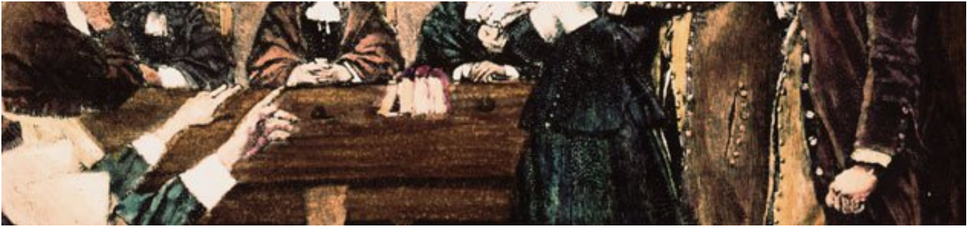
A girl is accused during the Salem Witch Trials

The Salem witch trials occurred in colonial Massachusetts between 1692 and 1693. More than 200 people were accused of practicing witchcraft—the Devil's magic—and 20 were executed. Eventually, the colony admitted the trials were a mistake and compensated the families of those convicted. Since then, the story of the trials has become synonymous with paranoia and injustice, and it continues to beguile the popular imagination more than 300 years later.