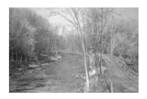
Ground for the Erie Canal was broken on 4 July 1817.