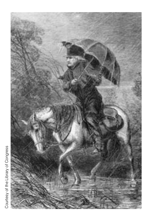
A Methodist circuit rider, drawing by A. R. Waud