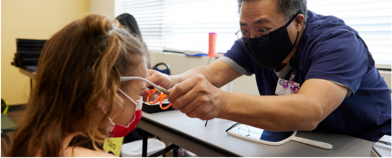
Above: An optometrist places a pair of eyeglasses after a free eye exam in Houston, Texas.