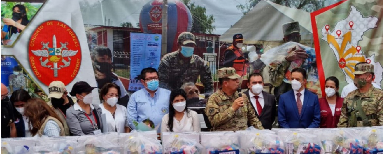
Above: A group of officials gather donations to the General Hospital of the Barrio Obrero in Asunción, Paraguay.