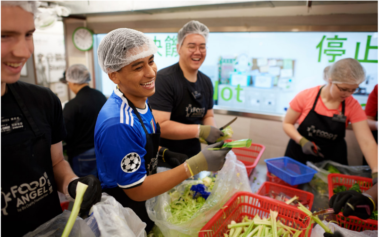
Above: Missionaries help prepare food during a service project in Hong Kong.

“Now is the time we can bless others and ‘lift up the hands which hang down.’”