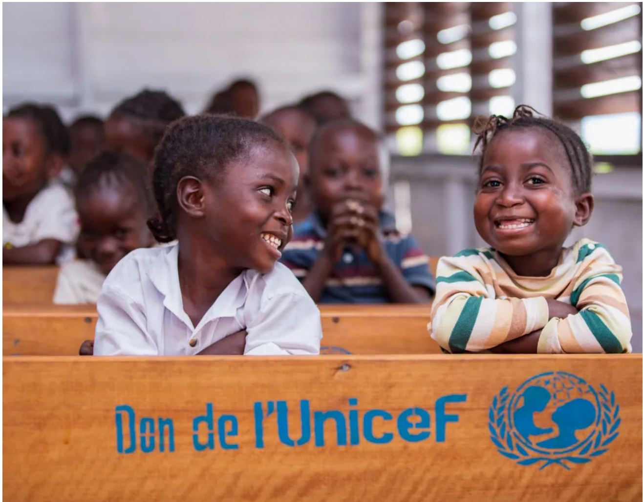
Above: Two young children in South Sudan happily attend their new school.

This year, the donations of Church members and friends to Light the World provided meals, clothing for children, polio vaccines, chickens to help struggling families, feminine hygiene kits, and more. People from around the world contributed, with total donations exceeding millions.