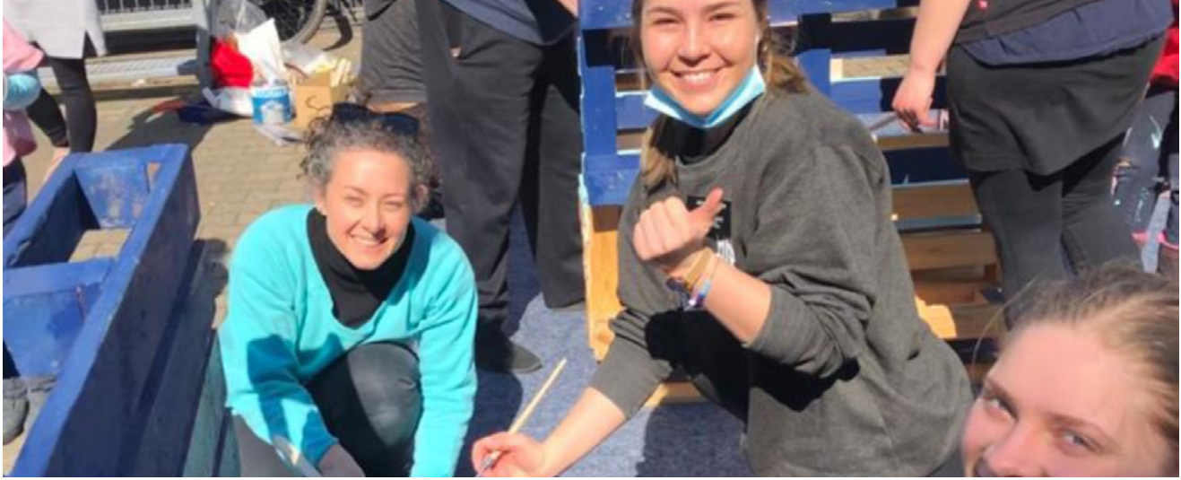
Above: A group of service missionaries paint furniture at Caritas homeless refugee center in Friedrichsdorf, Germany.