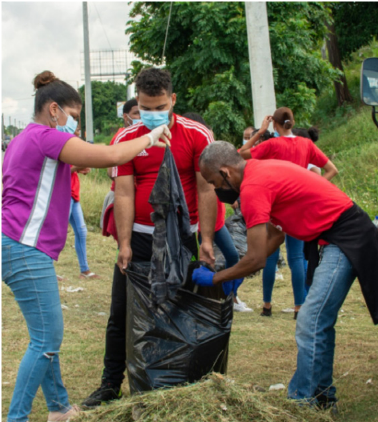
Photo at top: Locals in the Caribbean support each other following the impact of Hurricane Fiona.