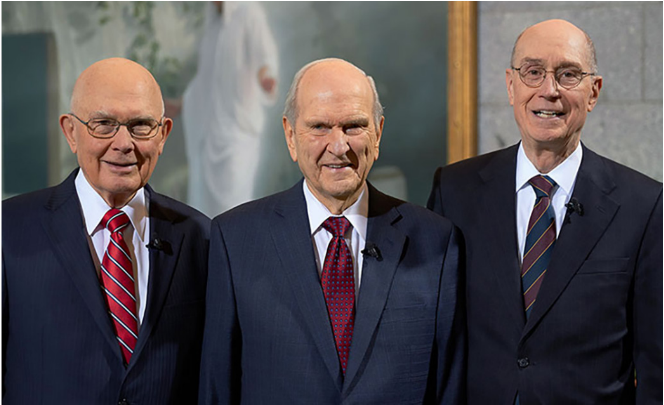
Above: President Russell M. Nelson with his two counselors, Dallin H. Oaks and Henry B. Eyring.