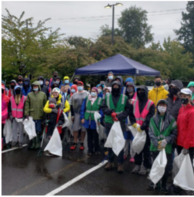
Above: At an interfaith trash pickup day in Portland, Oregon, volunteers came together to collect between 500 and 600 pounds of trash.

“In times of ever greater polarization ... being curious about and understanding our neighbours’ faith perspectives or spirituality allows us to become better neighbours.”