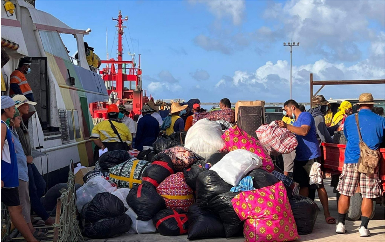
Above: Congregations in the area gathered and donated needed items to help the people of Tonga.

“The humanitarian work of the Church is such a gift. It is the product of the collective, consecrated offerings of the Saints, a manifestation of our love for God and His children.”