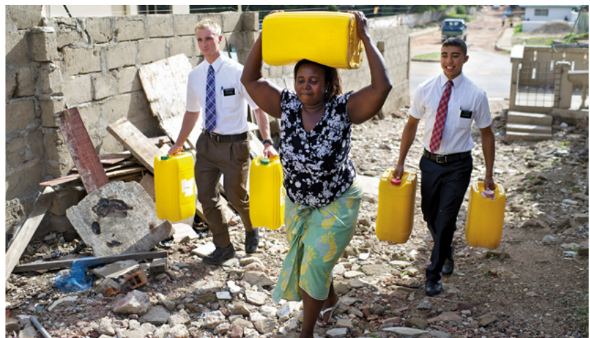
Above: Two missionaries serve the people of Ghana, West Africa.

Missionaries drove up to six hours from Canada to a small town in Minnesota in the United States to coordinate relief efforts following