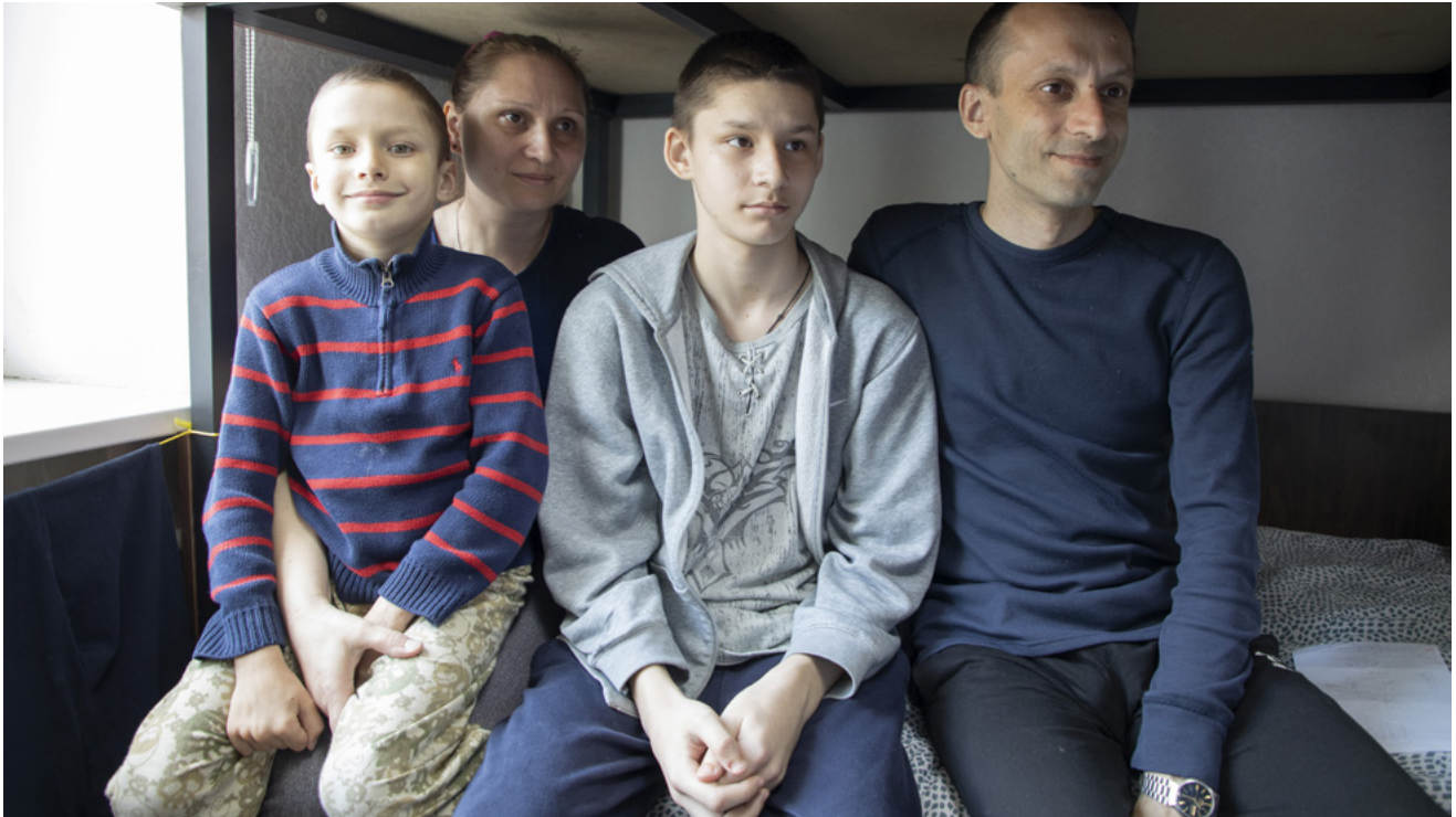
Above: A Ukrainian family that has found shelter in another European country.

“The Church of Jesus Christ of Latter-day Saints is one of USA for UNHCR’s most trusted and long-standing partners. Together we continue to restore hope, safety, and dignity to the over 100 million individuals forcibly displaced from their homes due to persecution, conflict, or violence.”