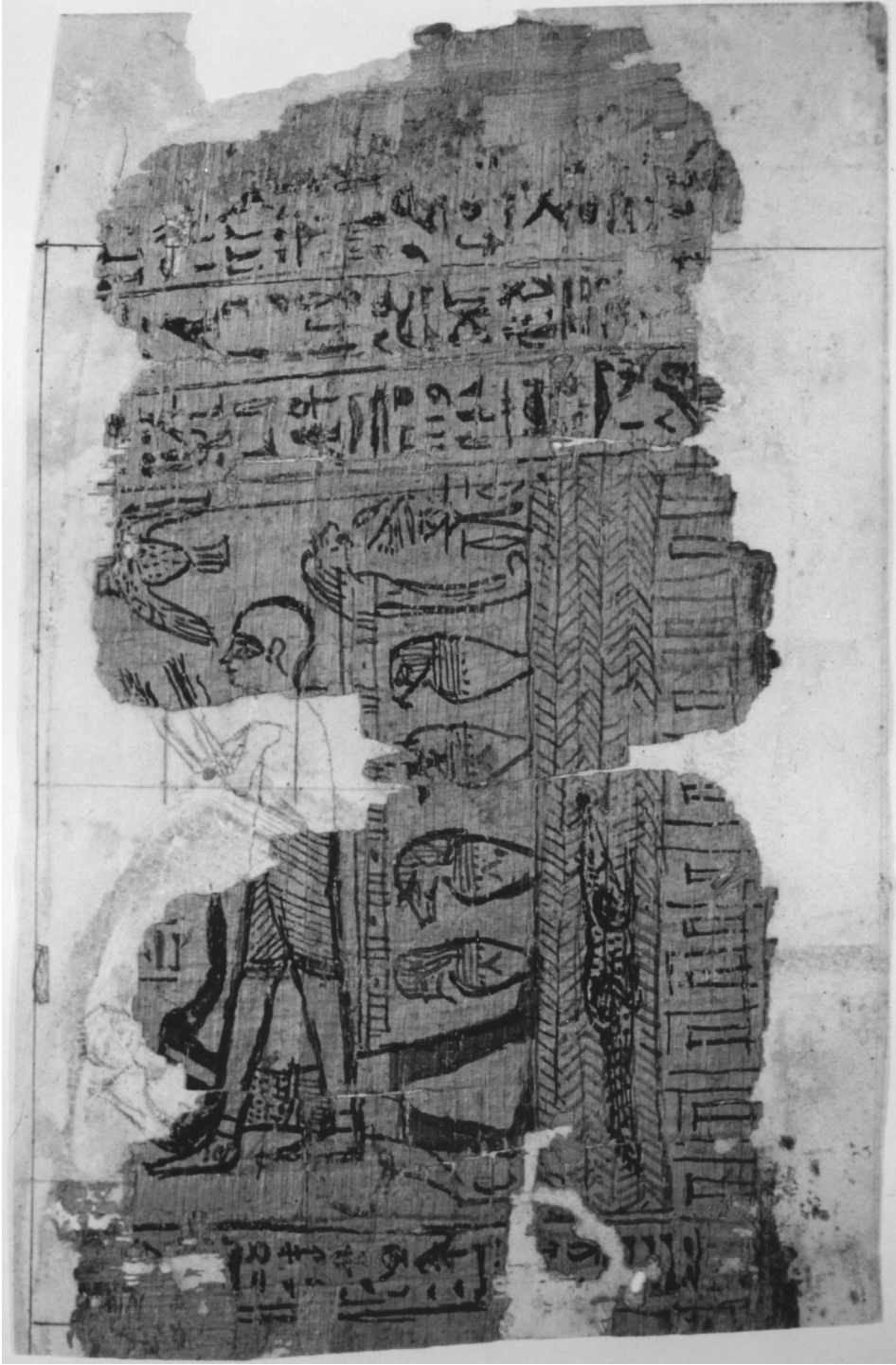
FIG. 1.—Papyrus Joseph Smith (= Col. D).