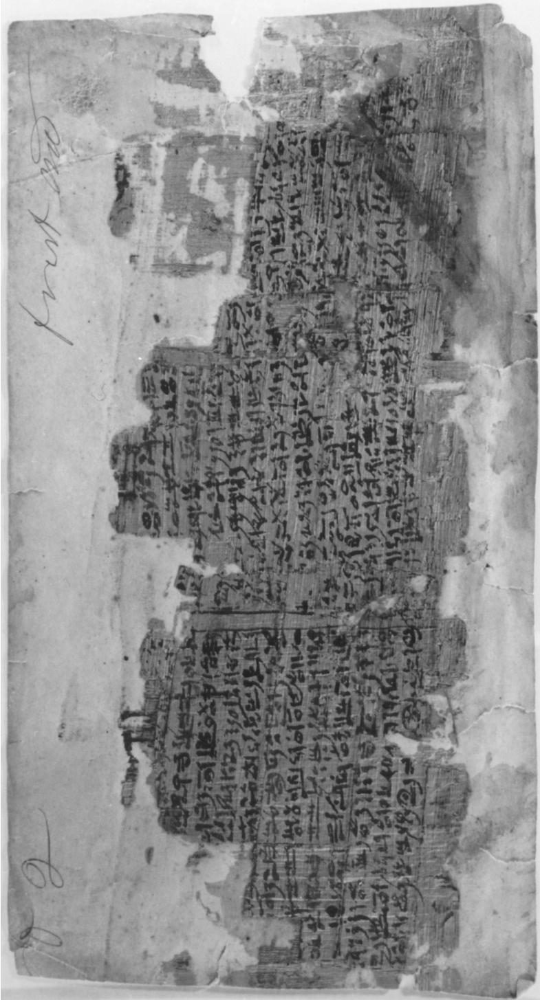
FIG. 3.—Papyrus Joseph Smith (= Col. IV-V).