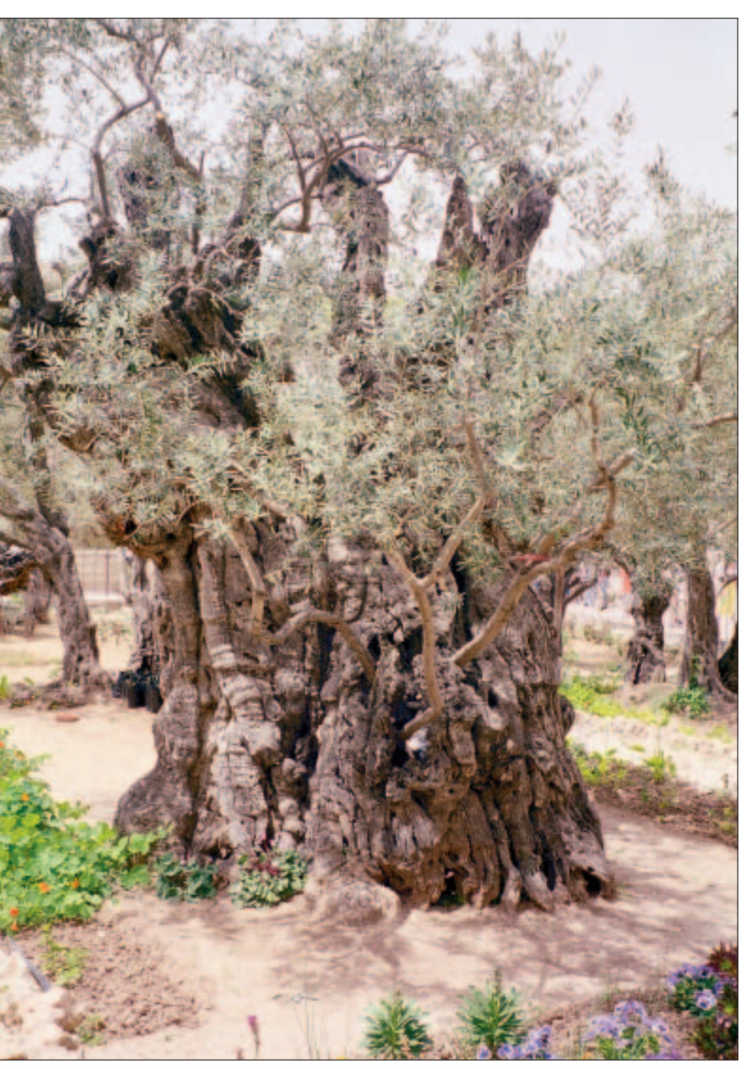
In the Book of Mormon's figurative language of the olive tree, we are taught that a "branch" from the original ethnic tree representing Israel in Palestine would be carried to the American promised land, where it would be "grafted" onto an indigenous root or people.