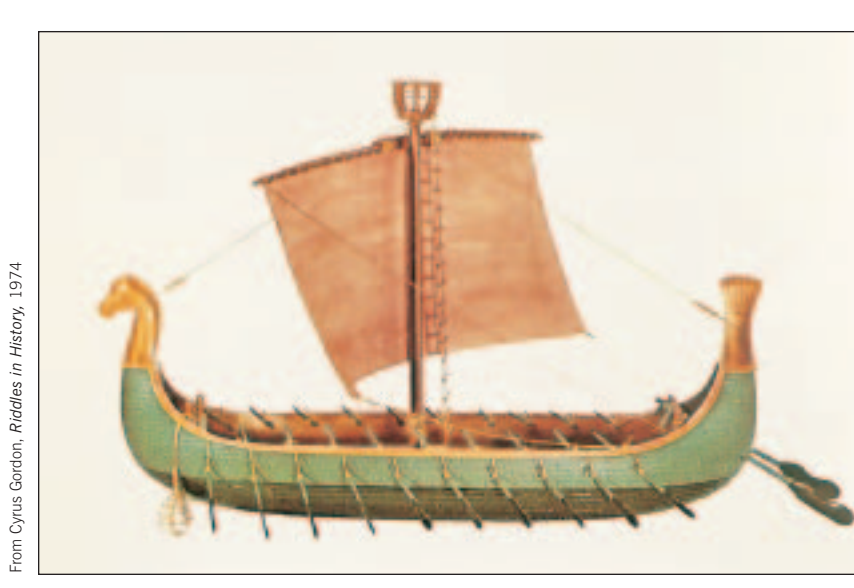
This kind of Phoenician ship (shown in a model based on ancient descriptions) sailed from the Mediterranean Sea at least as far as the Azores in the Atlantic by 800–900 в.с. A vessel like this one was capable of carrying Mulek's party to America.

Traditions are not, of course, to be believed as completely historical reports, but when the core of a tradition is reported numerous times and in disparate sources, it is likely that there was a factual basis behind it. Mesoamerican traditions that report ancient arrivals by sea are found recorded in early