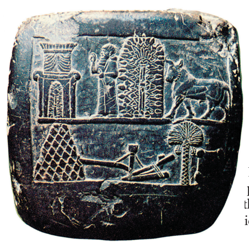
Assyrians represented the sacred tree of divine fertility in several iconic forms.

Knowest thou the meaning of the tree which thy father saw? (1 Nephi 11:21)