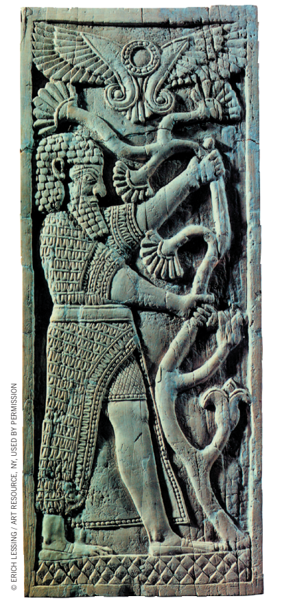
From Assyria, the ninth century {\tt B.C.}

guide carefully stressed, simply "the mother of the Son of God, after the manner of the flesh. " <sup>58</sup> But she was the perfect mortal typification of the mother of the Son of God.